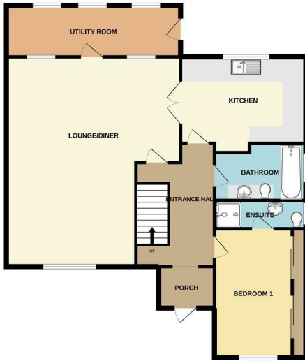
GROUND FLOOR 1103 sq.ft. (102.4 sq.m.) approx.